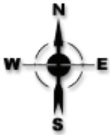
Sketch Floor Plan

Land Size _____ No. of Rooms _____ Construction - Roof _____ Walls _____ Water Pressure _____ No. of Bathrooms _____